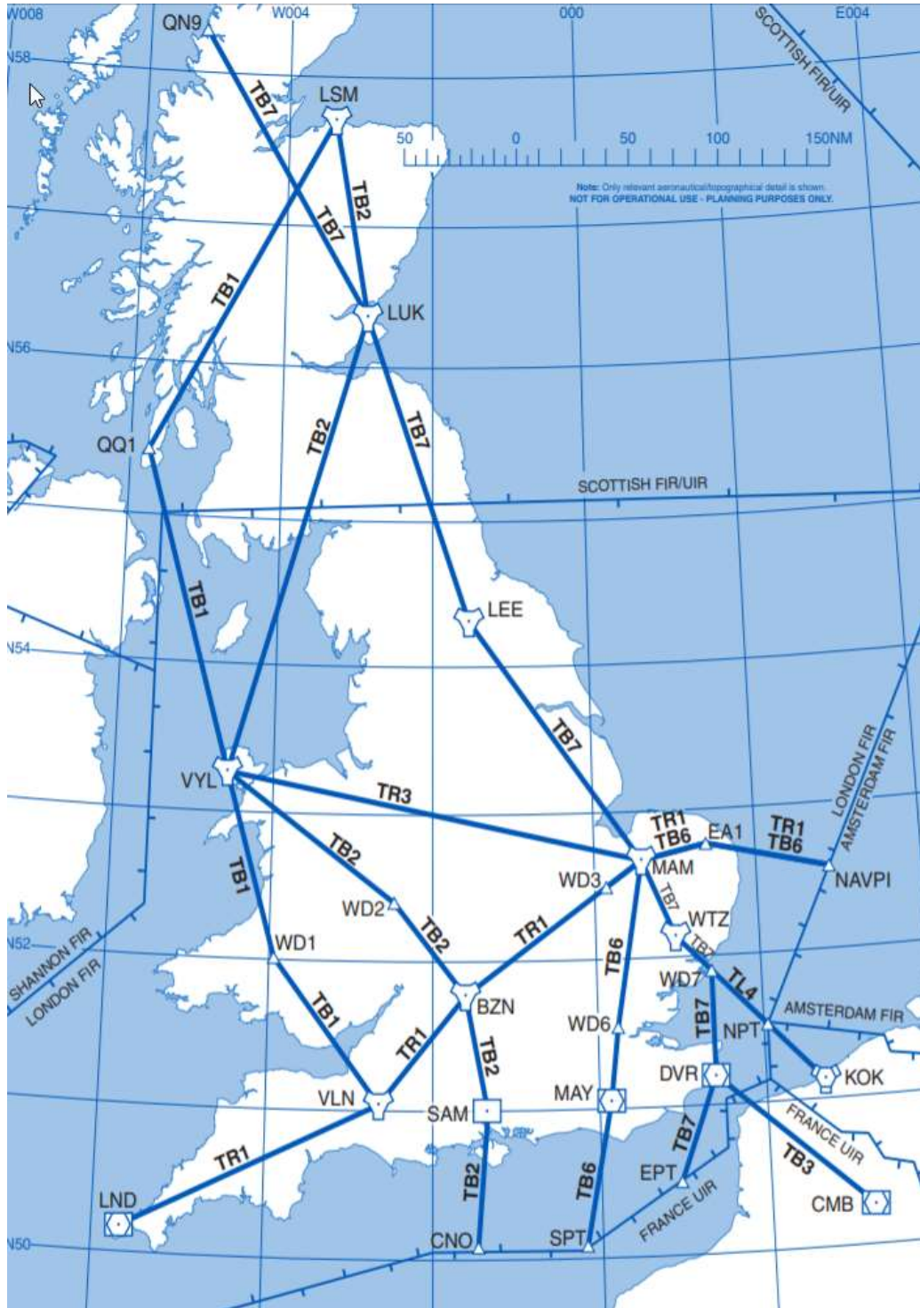
TACAN Documentation - https://www.aidu.mod.uk/aip/pdf/enr/ENR-4-1.pdf

The following chart shows the routing available from the edge of Airspace in the United Kingdom.