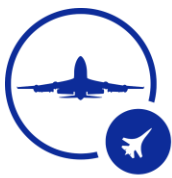
Military Training Areas [ED-R (TRA), ED-R (VPA) and CBA] - Lower Airspace